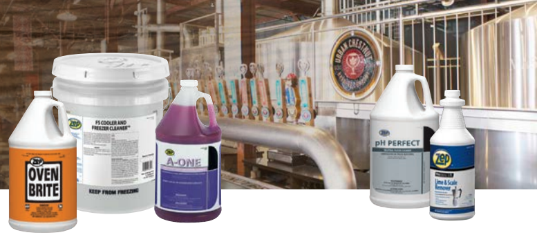
TABLE AND FOOD SURFACE SANITIZING