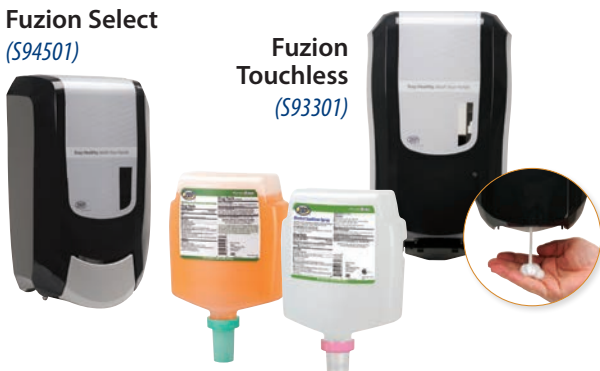
Fuzion Touchless (S93301)