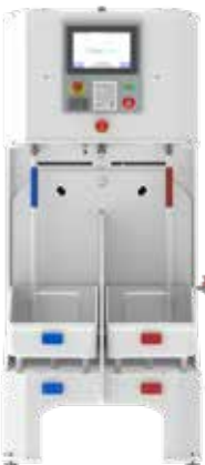
Custom ALX Chemical Allocation System