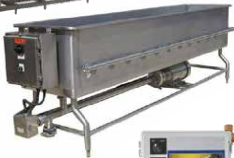
Custom Designed COP Tank