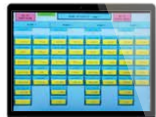
Data Logging System