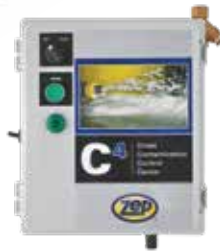
C4 Doorway Foamer W59901