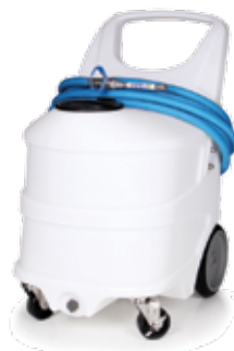
30-gal Rolling Foamer AF08FI-30N