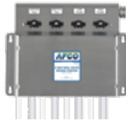
4-way Mixing Station AF08985400