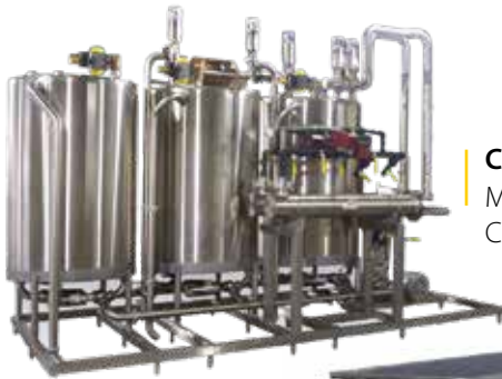
Custom Multi-Tank CIP System

maintenance products convenient, cost efficient and highly effective. If you have specialized needs, we also provide Custom Equipment & Installation to solve your most difficult application and dispensing problems.