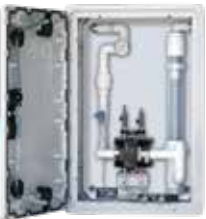
Custom Enclosed Chlorine Dioxide Generator