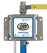
Wall-Mounted Sanitizer N80301