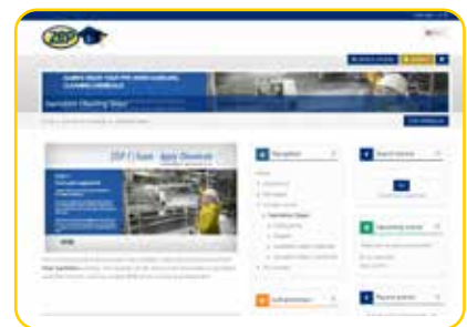
Online Training Center